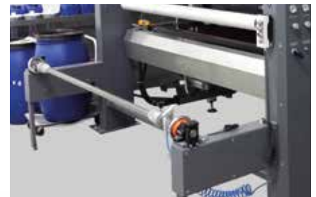
Small batch (up to 40 cm diameter) take-up system, with pneumatic expander shaft for 3 inch (75 mm) diameter cardboard rolls