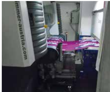
Loop control system for synchronization of printer and dryer.