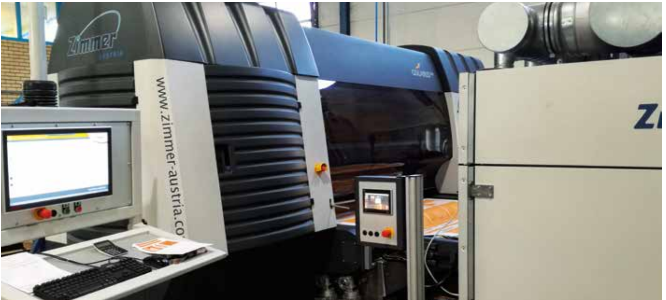
COLARIS inkjet printer incl. base frame, print blanket with drive and rotary encoder, blanket position control by a linear encoder, glue applicator for sticky belt. Electronic control and electrical appliance, computer workstation and touch screen as a human-machine interface, incl. print software.