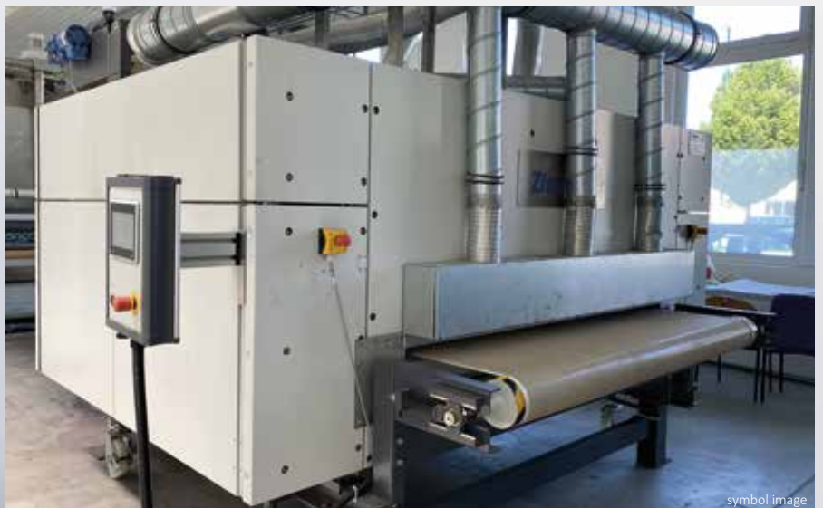
One chamber high capacity hot air nozzle dryer, gas heated with single fabric pass through the dryer.