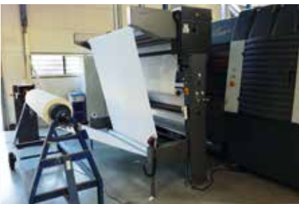
Fabric feeding and positioning system with E&L lath guiding roller, with pendulum for speed synchronization with the printer.