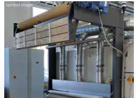
Crank gear plater for delivery of printed substrate onto a pallet or into a trolley.